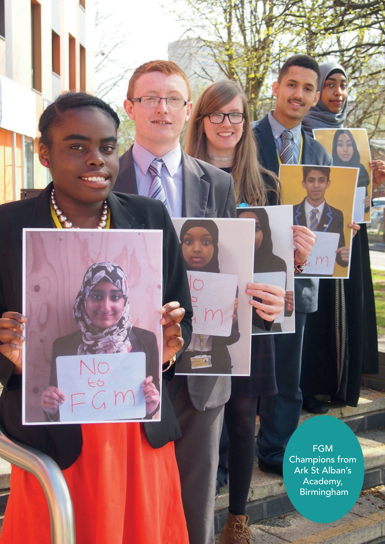
FGM Champions from Ark St Alban's Academy, Birmingham